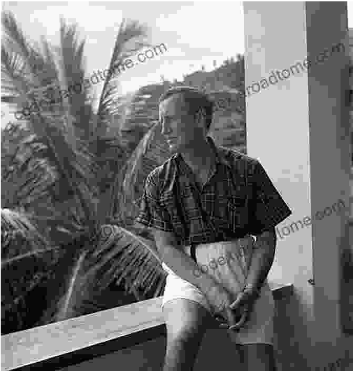
Ian Fleming in Jamaica, where he wrote many of his Bond novels