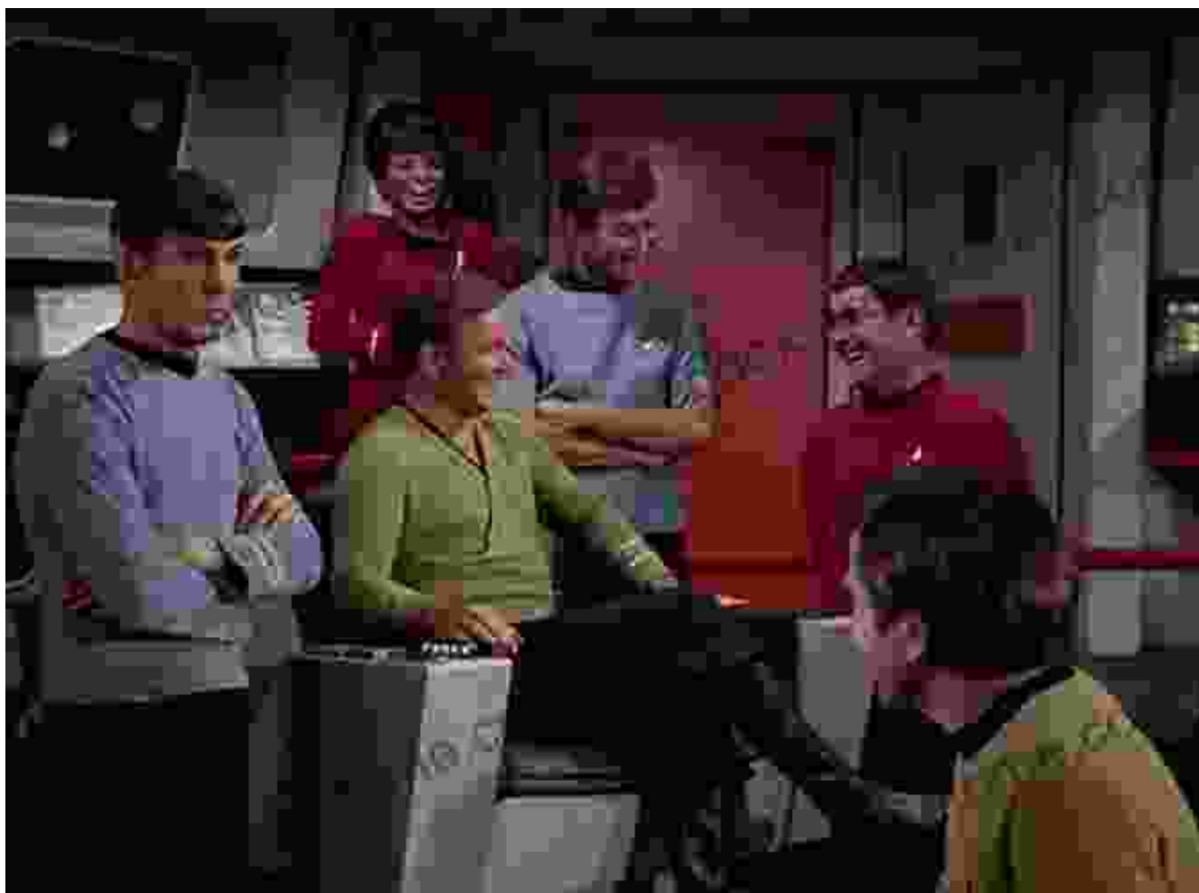
A Battle for the Ages: Kirk vs. Khan

The novel's vivid descriptions and immersive storytelling transport readers into the heart of the Star Trek universe. From the claustrophobic corridors of the Enterprise to the sweeping landscapes of the Genesis planet, the settings are brought to life with a level of detail that makes them feel tangible.