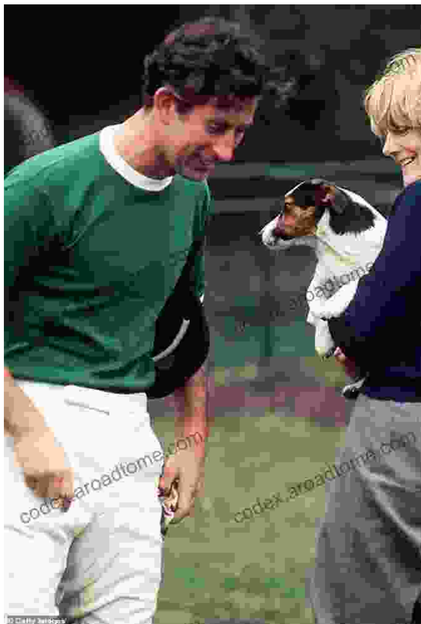
Prince Charles shares a special connection with his canine companion, Tigga.

Prince Charles, the Prince of Wales, is a passionate advocate for the environment and animal welfare. The book highlights his dedication to various conservation projects, including his work with The Prince's Countryside Fund and his support for sustainable farming practices. It also examines his deep bond with his dogs, especially his beloved Jack Russell Terrier, Tigga.